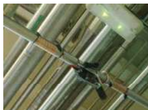
Vulcan 3000 installed in the Delice Danone factory