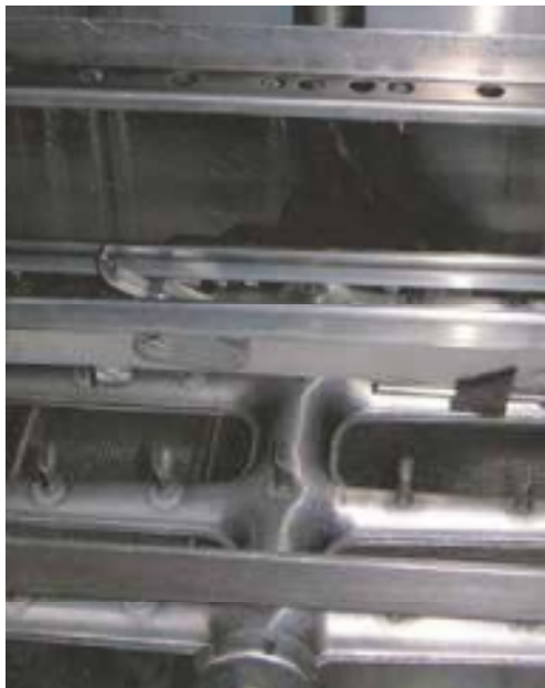
Scale free dishwasher