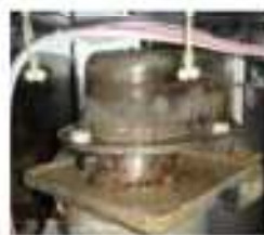
Vulcan protecting the ice-cream makers