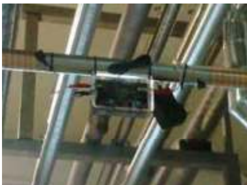
Vulcan 3000 installed in the Delice Danone factory