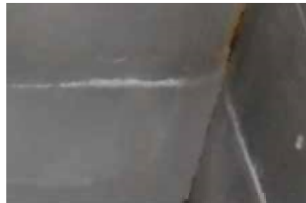
Before Vulcan installation - calcium lines present on stainless steel after only 3 weeks.

The installation of Vulcan 1000 and Vulcan 5000 solved this hard build-up problem successfully.