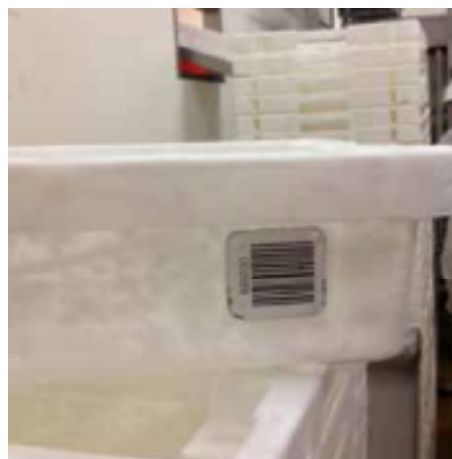
White containers and barcodes are now free of scale