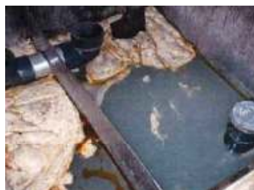
3 months after installation - grease is more consistent and less cluttering