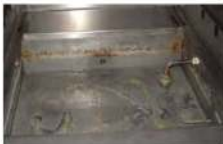
Before Vulcan installation - hard scale build up in the pan area