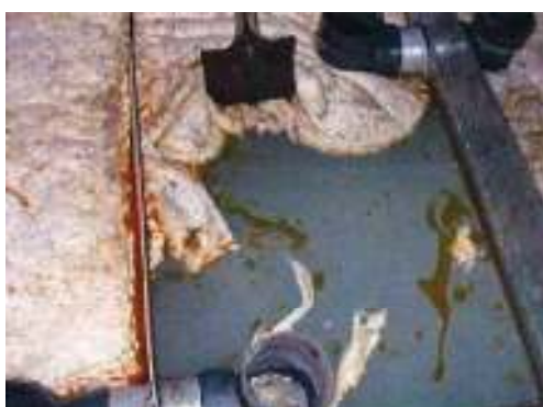
Before Vulcan installation