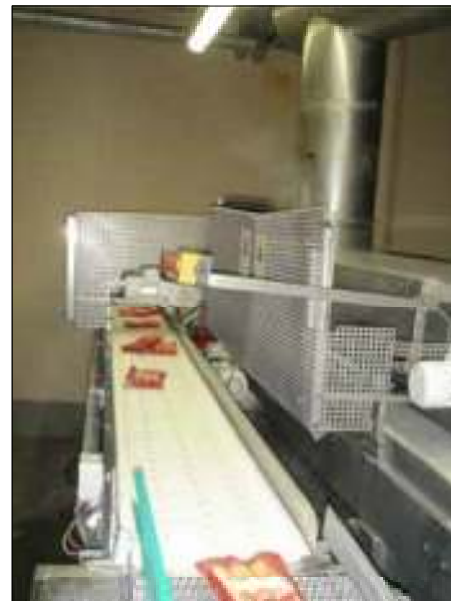
Sausage packaging line