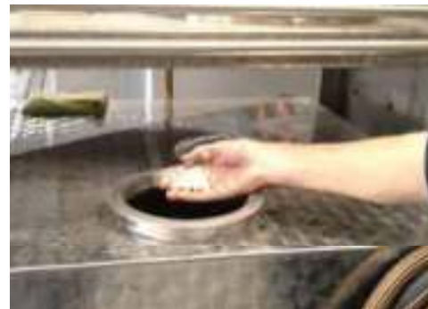
Scale desposits removed after installing the Vulcan 3000