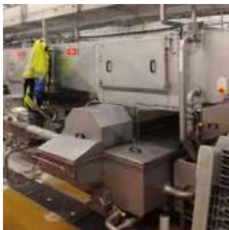
Washing machine used for the white containers

Before installing the Vulcan unit, the scanning machine could not read barcodes due to scale incrustations. Now after installed Vulcan, the machine is able to read these bar codes correctly. Bigard is now saving on maintenance costs and reduced time spent on cleaning the washing machine and white boxes.