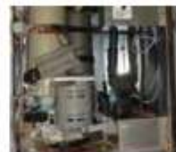
Vulcan protecting the ice machine