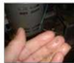
Soft limescale is now easily removed