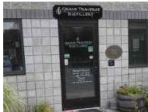
Grand Traverse Distillery