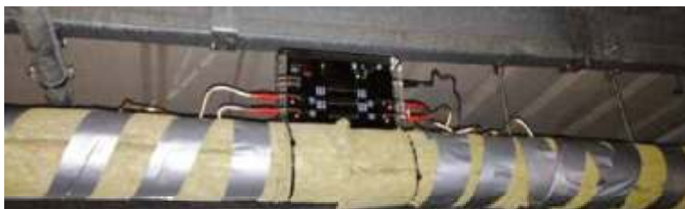
Vulcan S25 unit installed with insulation re-wrapped over the pipes and impulse cables